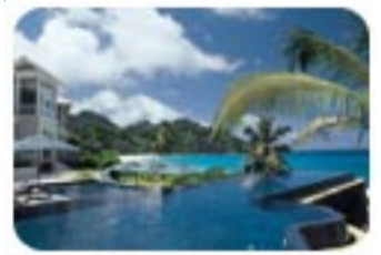
Main Pool view