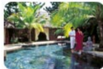
Spa by Clarins