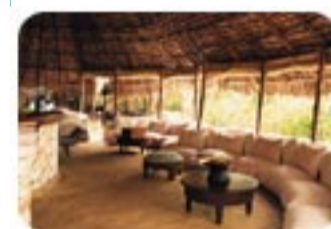
Lounge & Bar